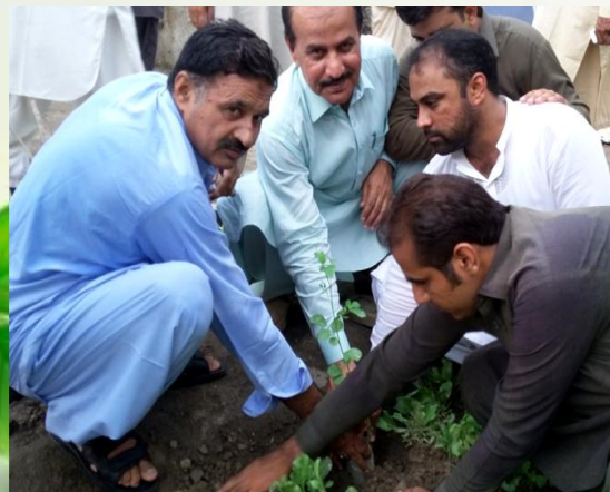
SDM Lakhi planted a plant at Chak Shikarpur