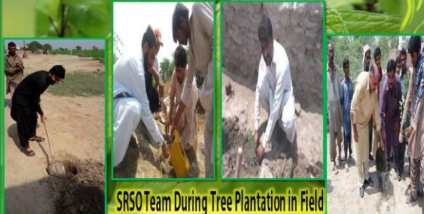
SRSO Team During Tree Plantation in Field

Sindh Rural Support Organization District Jacobabad